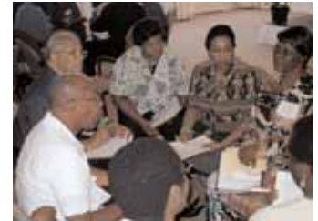
Small Group discussion at a Jamaican Preaching Seminar