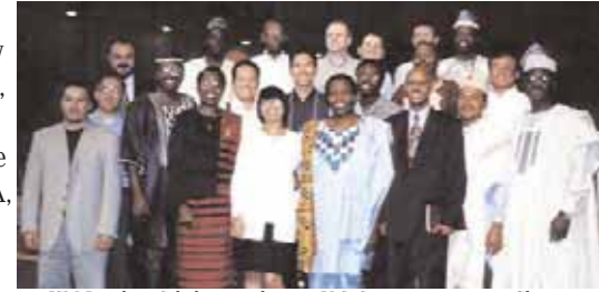
JSM-Langham Scholars studying at U.S. Seminaries meet in Chicago

This year also marked our 30 th anniversary as a ministry. To determine the impact from three decades of labors, we commissioned a detailed Outcomes Evaluation Study (OES). We were encouraged by the remarkable results God has enabled our ministry to have around the world. As primarily a volunteer movement throughout the first twenty years of our existence, we have seen rapid growth over the last decade. The OES shows substantial impact in many regions, and also highlights areas needing greater attention in the years to come. If you would like to receive an Executive Summary of the OES, email us at info@johnstott.org .