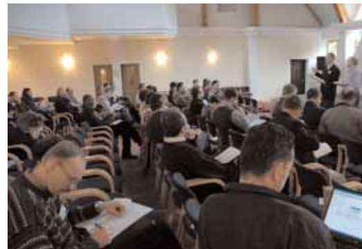
Pastors gather for a group session in Poland

Preaching movements launched by JSM-Langham Preaching are gaining momentum, now in 22 countries with requests from 80 more. We offer preaching seminars to support these movements, with several countries already in the second year of a three-year curriculum.