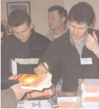
Books being distributed in Peru