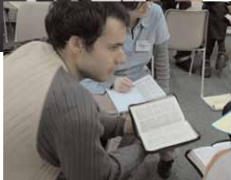
Polish pastors work together