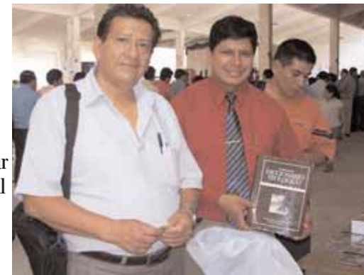
JSM-Langham Literature distributed needed books at a recent pastors conference in Peru.